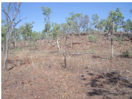
Top of Volcanic breccia pipe at Copperado JV

Phone: +61 8 9322 6045 Fax: +61 8 9481 5557 Email: info@redbankmines.com.au