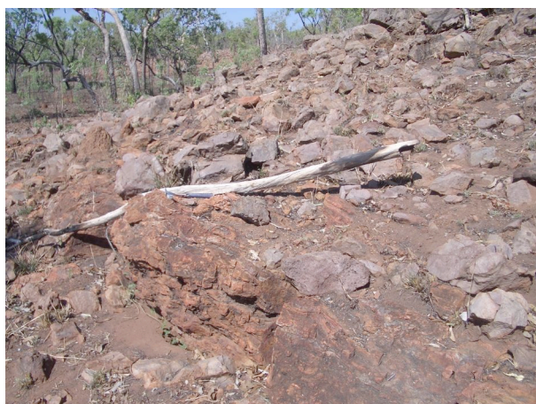
Gold Creek Volcanic host rock layering indicating slumping towards the pipe core.